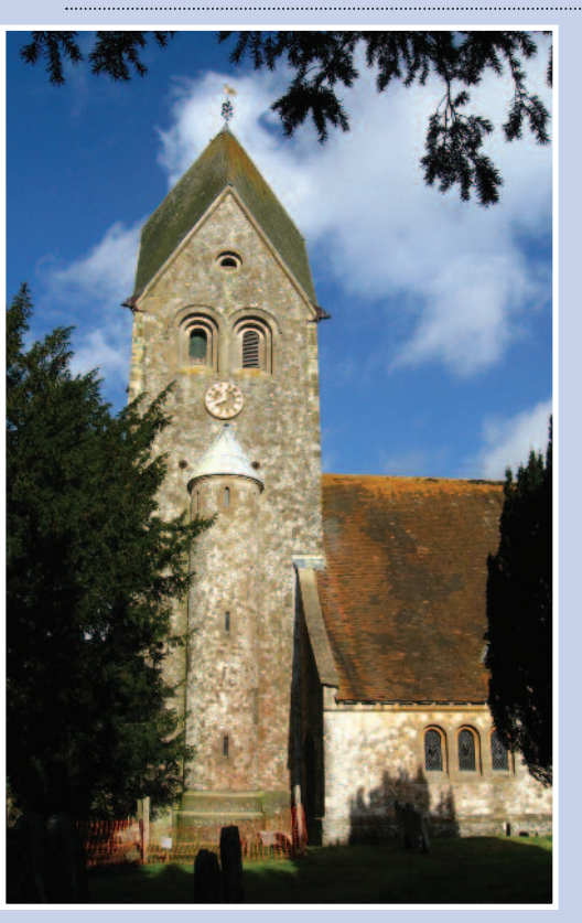
The Rhenish Helm bell tower of Hawkley church